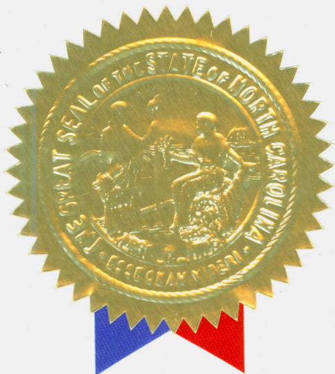
BEVERLY EAVES PERDUE

NOW, THEREFORE, I, BEVERLY EAVES PERDUE, Governor of the State of North Carolina, do hereby proclaim May 22-28, 2011, as " GRADUATE EDUCATION WEEK " and May 25, 2011, as " GRADUATE EDUCATION DAY " in North Carolina and commend its observance to all citizens.